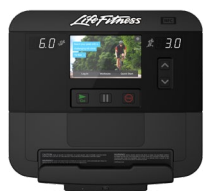
INTEGRITY X CONSOLE