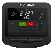
INTEGRITY C CONSOLE (Simple base only.)

Console choices include simple, get-on-and-go functionality to more engaging options. Each offers wireless connectivity and insights through LFconnect.com.