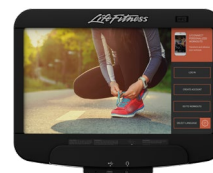
DISCOVER SE3 HD CONSOLE