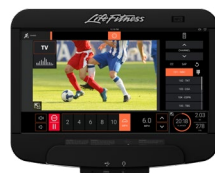
DISCOVER ST CONSOLE