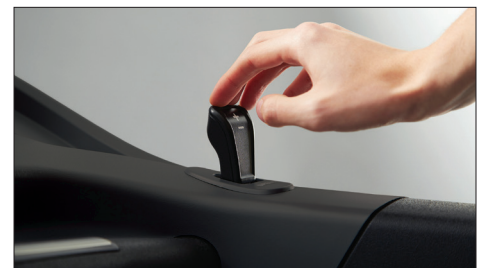
Quick speed & elevation paddle shifters