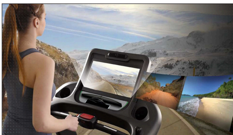
Intuitive, easy-to-use touchscreen console with Virtual Connect™ scenic videos