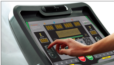
19" LED Console with toggle shifters and reading rack / tablet holder