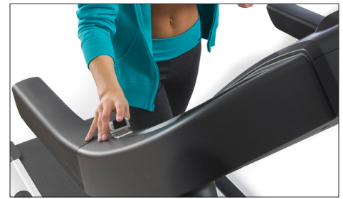
Quick shifters for fast-and-easy adjustments