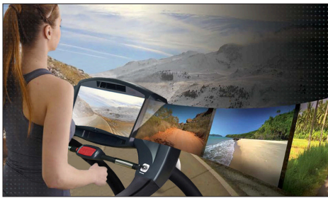
Intuitive, easy-to-use touchscreen console with Virtual Connect™ scenic videos