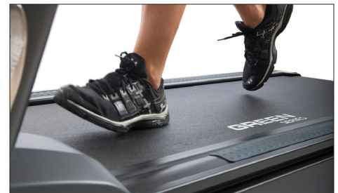
25,000 mile maintenance-free running belt