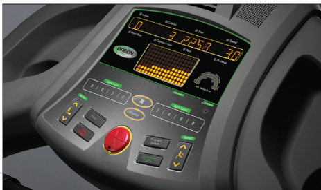
Intuitive, easy-to-use console