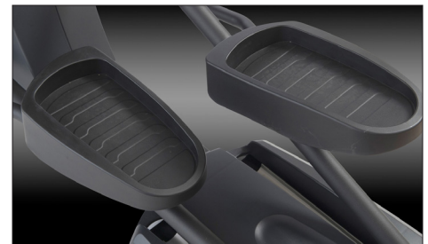
Heavy-duty, over-sized footplates