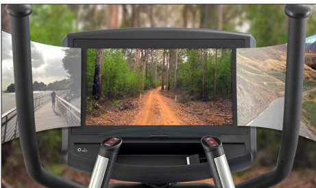
Intuitive, easy-to-use touchscreen console with Virtual Connect™ scenic videos